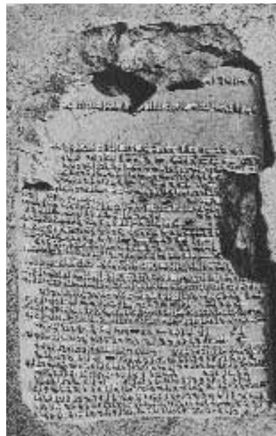
Epilepsy Tablet in the British Museum

The rapid development of structural and functional imaging techniques in the last thirty years, including CT, MRI, SPECT and PET, has had a major impact on the investigation and understanding of