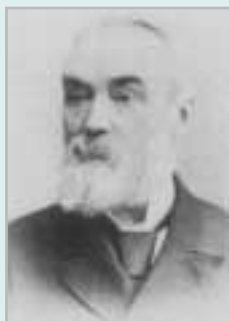
John Hughlings Jackson in later life

His political writings were a reaction against the contemporary fashion for hierarchical organisations, which was at the core of Hughlings Jackson's own neurological philosophy. Sparks probably fly on All-Souls night!