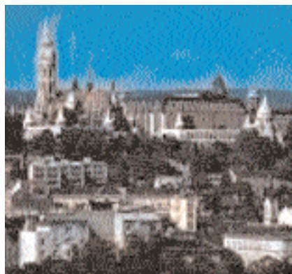
Budapest - the location for the Eurepa one-week seminar