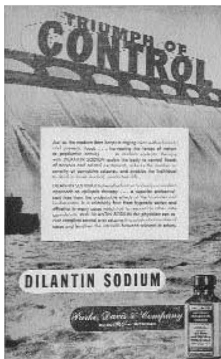
Albert Speer would have been proud of this advert!