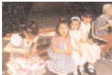
Children with epilepsy at the Hospital Calvo Mackenna

The international political gap refers to differences in planning and assignment of funds at the national level. In Chile there is no such planning for epilepsy, again contrasting with developed countries, where epilepsy health programmes have existed for several decades.