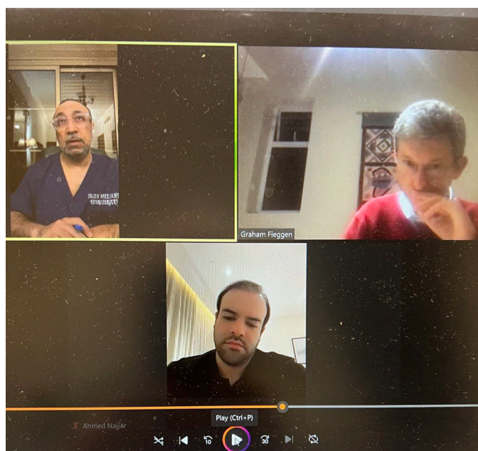
A webinar with ILAE-Eastern Mediterranean