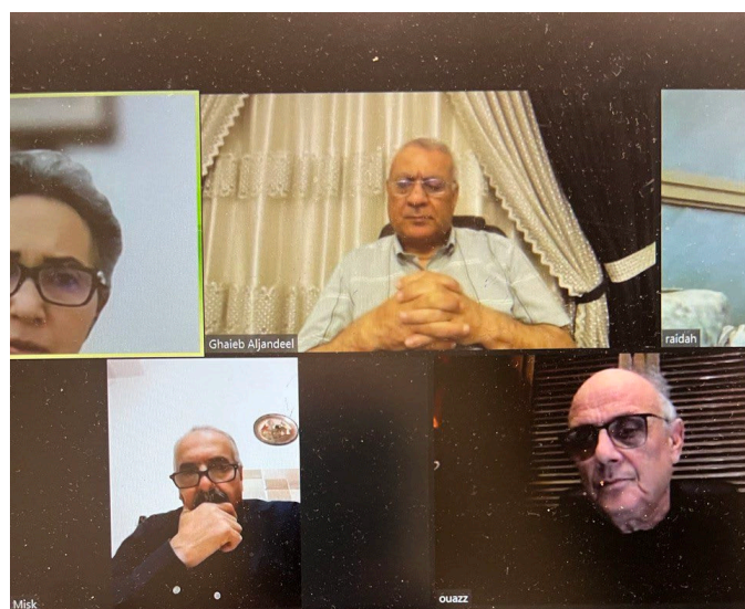
A virtual meeting with the ILAE-Eastern Mediterranean board