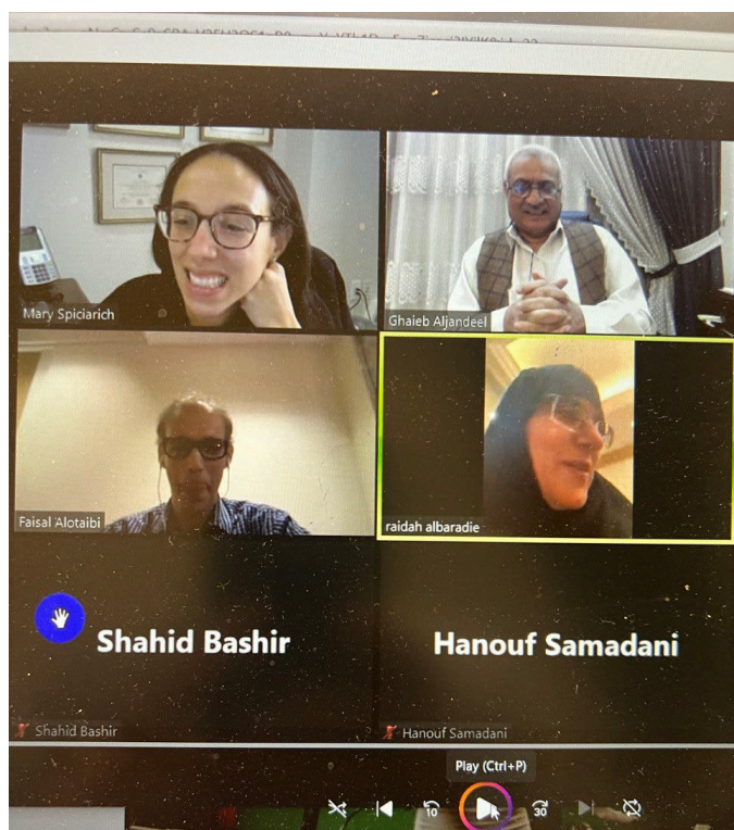
An English-language webinar with ILAE-Eastern Mediterranean