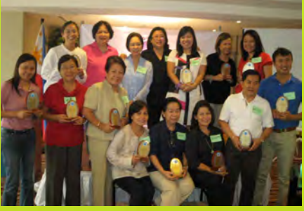
RECOMMITMENT AND RECOGNITION OF PAVES IN 2010

PAVES help train leaders and organize patient support groups