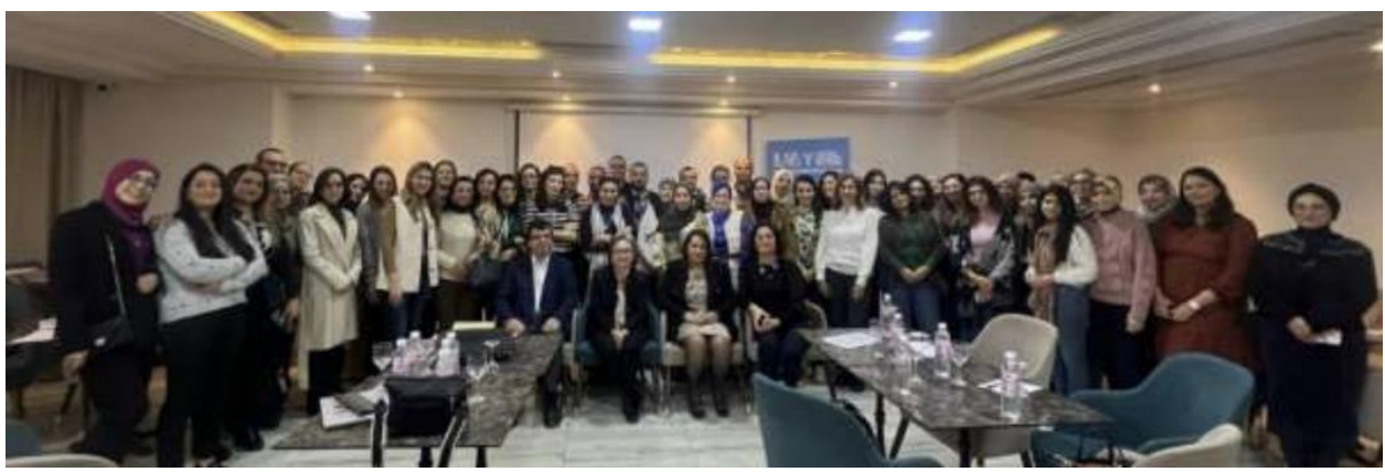
AirFit Project Impact of climate change on epilepsy