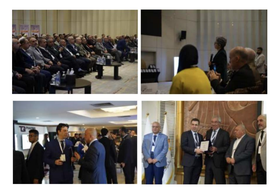
The First Iraqi Epilepsy Conference Rotana Babylon Hotel in Baghdad, Iraq 1-2 December 2023