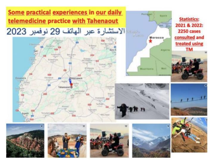
Telemedicine activities in different parts of rural areas in Morocco and Africa

2nd Nurse Educational Session in Epilepsy