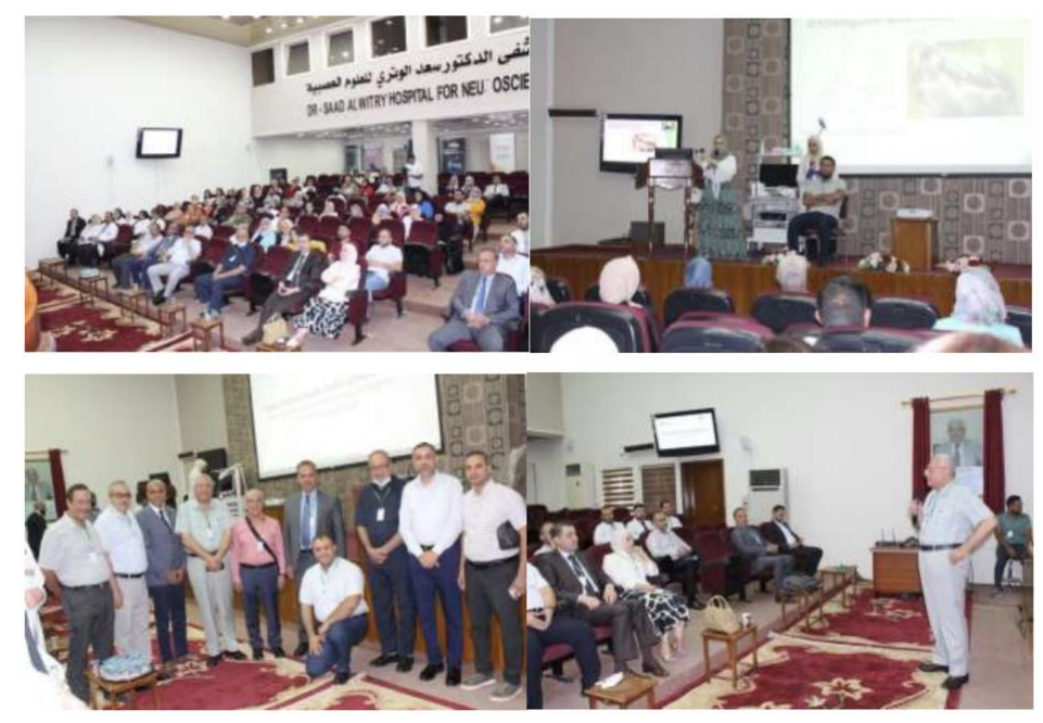
Eastern Mediterranean Region Epilepsy Course Saad Al-Witry Neurosciences Hospital-Baghdad 9-10 August 2023