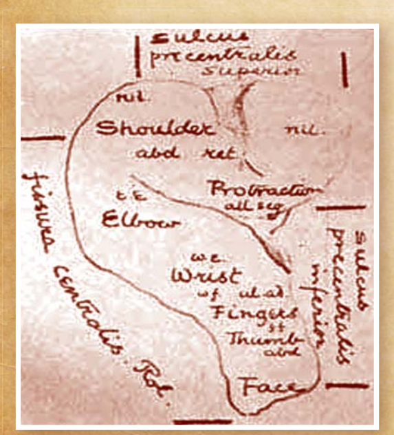
Horsley's sketches of stimulation points in excised cortex

5—page article titled 'Die operative Behandlung der Epilepsie' in a Berlin medical journal. And Harvey Cushing's seminal paper in Brain reported for the first time sensory responses and the sensory auras of focal attacks, produced by electrical stimulation of the postcentral cortex, in two patients awake under local anaesthetic. These were the leaders of the field at the time, but the great war of 1914—18 provided a new generation of neurosurgeons with the opportunity to study post—traumatic seizures.