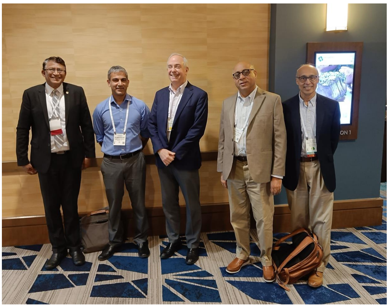
Participants at the workshop in Dublin, Ireland, September 2023