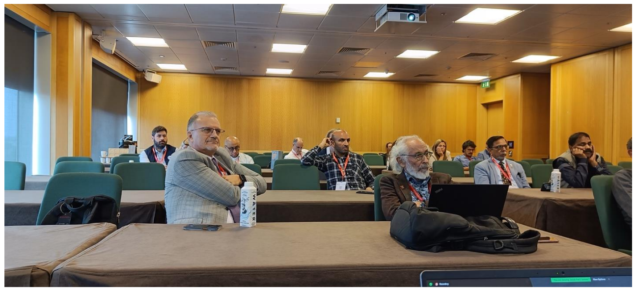
Wikipedia workshop at the American Epilepsy Society Annual Meeting in Orlando, USA, December 2023