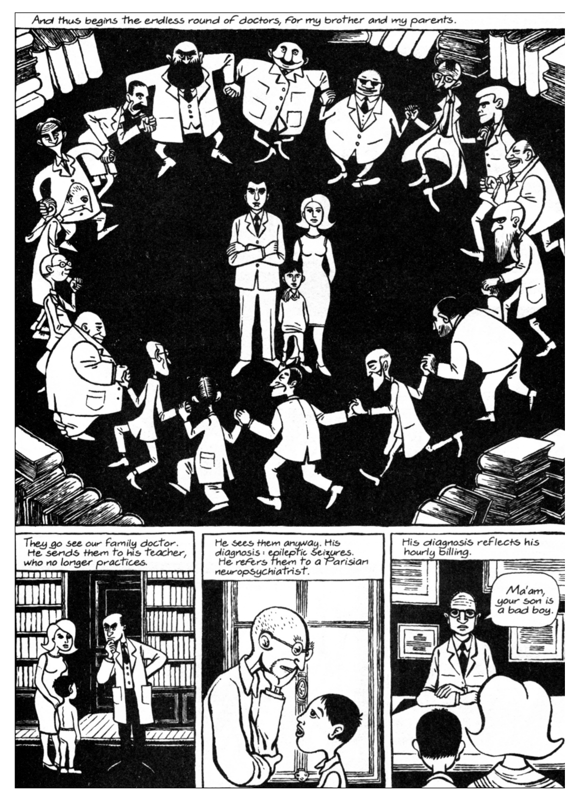
The social side of epilepsy is the focus of the International Bureau for Epilepsy. (Image from Epileptic , by David B., published by Jonathan Cape, London. Reprinted by permission of The Random House Group Ltd.)