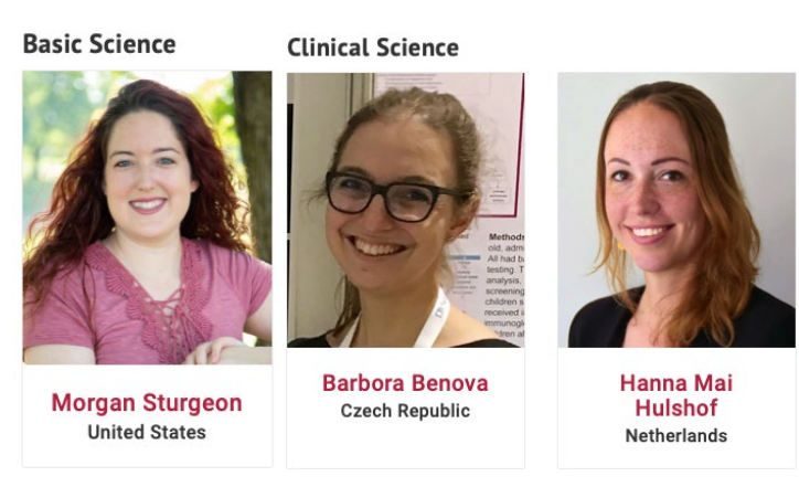
Figure 4: 2022 Epilepsia Open Prize awardees