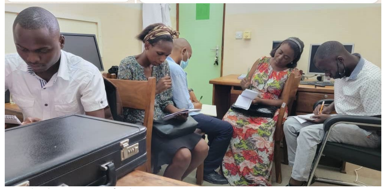
Journalist during interview for the campaign

https://www.clubhouse.com/event /PbR7RZWG?utm_medium=ch_event &utm_campaign=xk_jvDZgAJ-epepL -Afhvg-59439