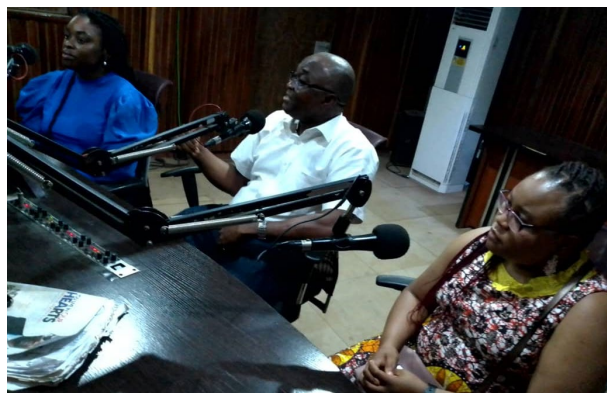
Radio Epilepsy Program

Two meetings in March 2021 and March 2022