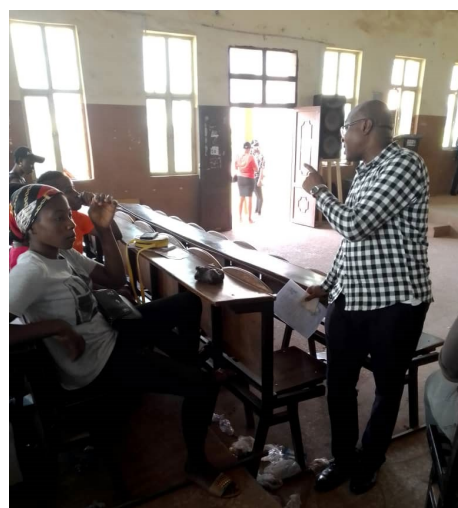
School awareness program in a lecture hall in the college of education in Enugu State