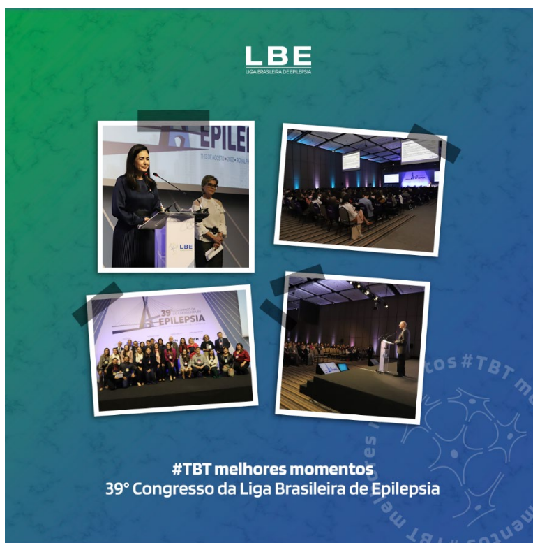
Photos from the 39th Brazilian Epilepsy Congress, 11-13 August 2023, in Campinas/SP, Brazil