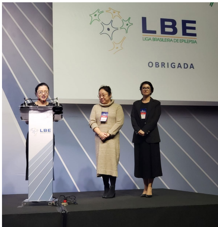
New executive committee (president, secretary, treasurer) of the Brazilian Epilepsy League speech and taking office on 12 August 2023, during the 39th Brazilian Epilepsy Congress