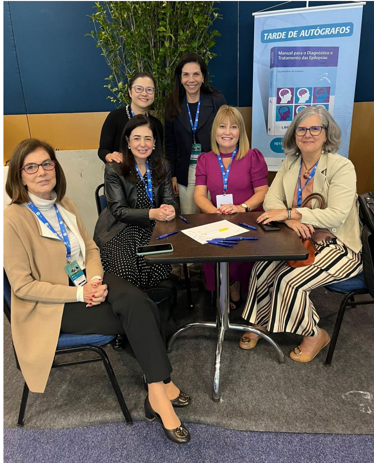
Book launch and autograph session with current and past presidents of the LBE at the Brazilian Congress of Child Neurology with approx. 1,500 participants