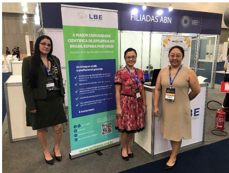
Dissemination and promotion of LBE's activities and advantages of its membership during the Brazilian Congress of Neurology with more than 2,500 participants