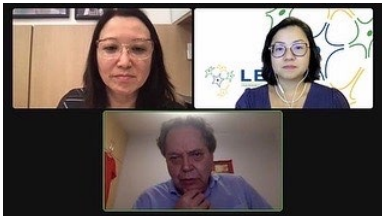
Example of one of the 10 webinars (LBE Talks) organized by LBE in 2022