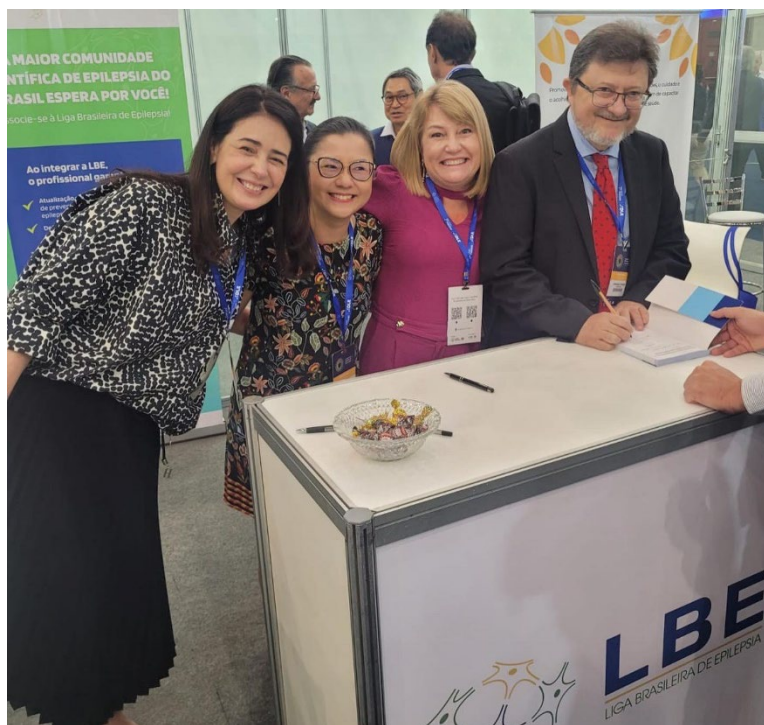
Book launch and autograph session with current and past presidents of the LBE at the Brazilian Congress of Neurology with more than 2,500 participants