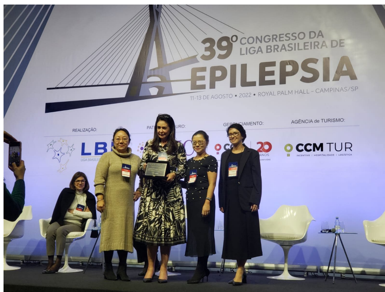
Past president and the new president of the Brazilian Epilepsy League