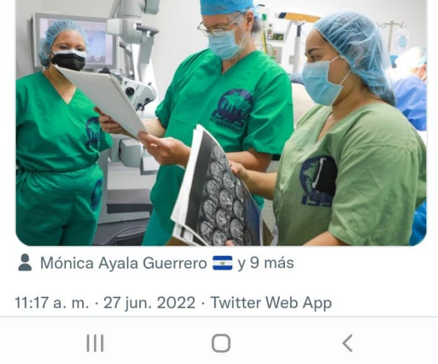
Communication on social networks of the first non-lesioned epilepsy surgery at the Social Security Institute