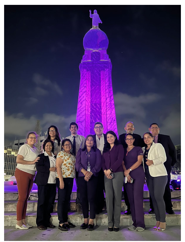
Commemoration of the Latin American day of epilepsy with the purple lighting of the monument "Divino Salvador del Mundo"