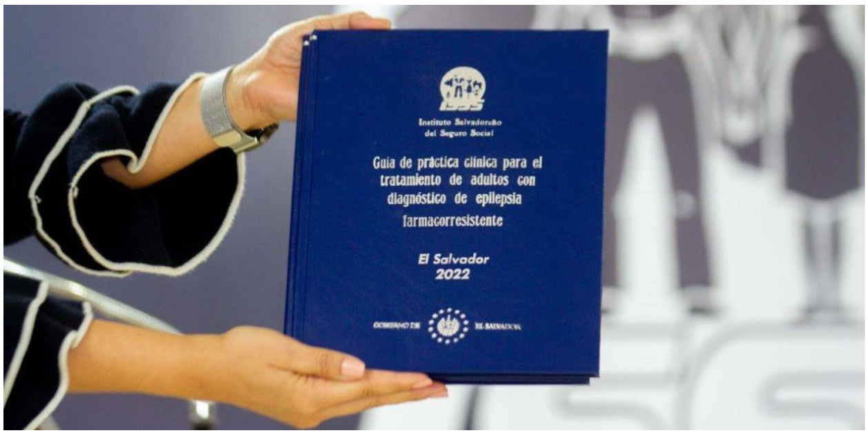
Presentation of guidelines and guide for the management of epilepsy in the Salvadoran Institute of Social Security