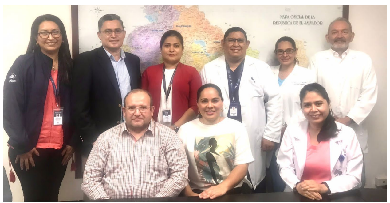
Technical committee on epilepsy with representatives of the national health system and CASALICE