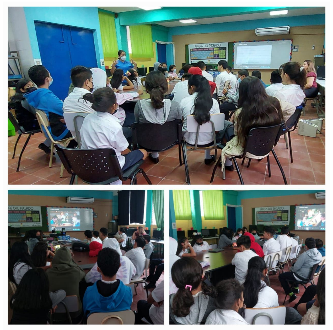
Sharing the video "Juanito y la epilepsia" in primary schools