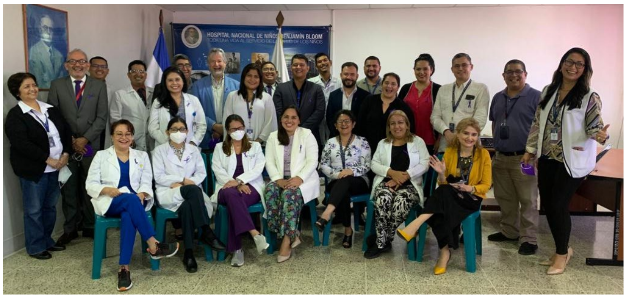
Meeting to seek alliances in epilepsy with members of the national health system