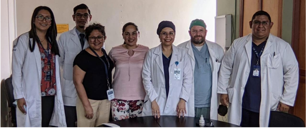
Members of the epilepsy technical committee team