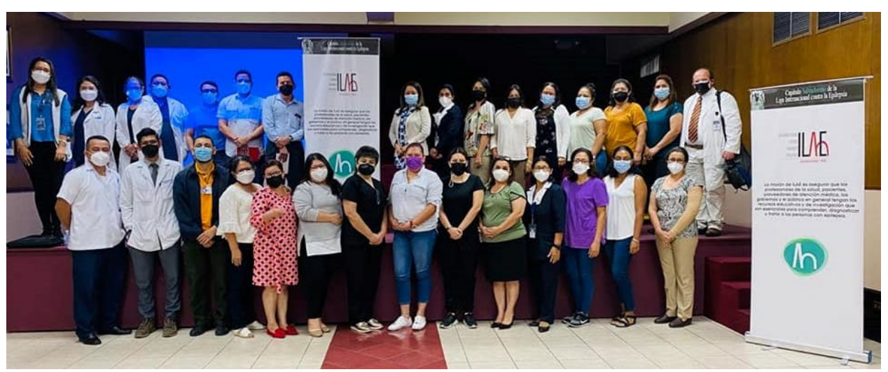
Socialization of epilepsy guidelines in the metropolitan area