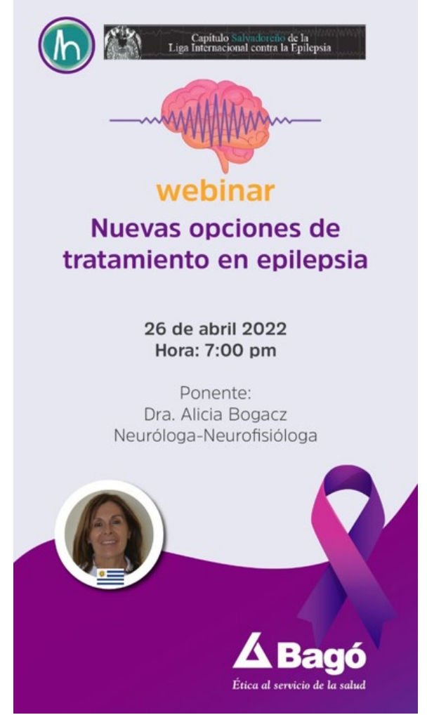
Web seminar, El Salvador