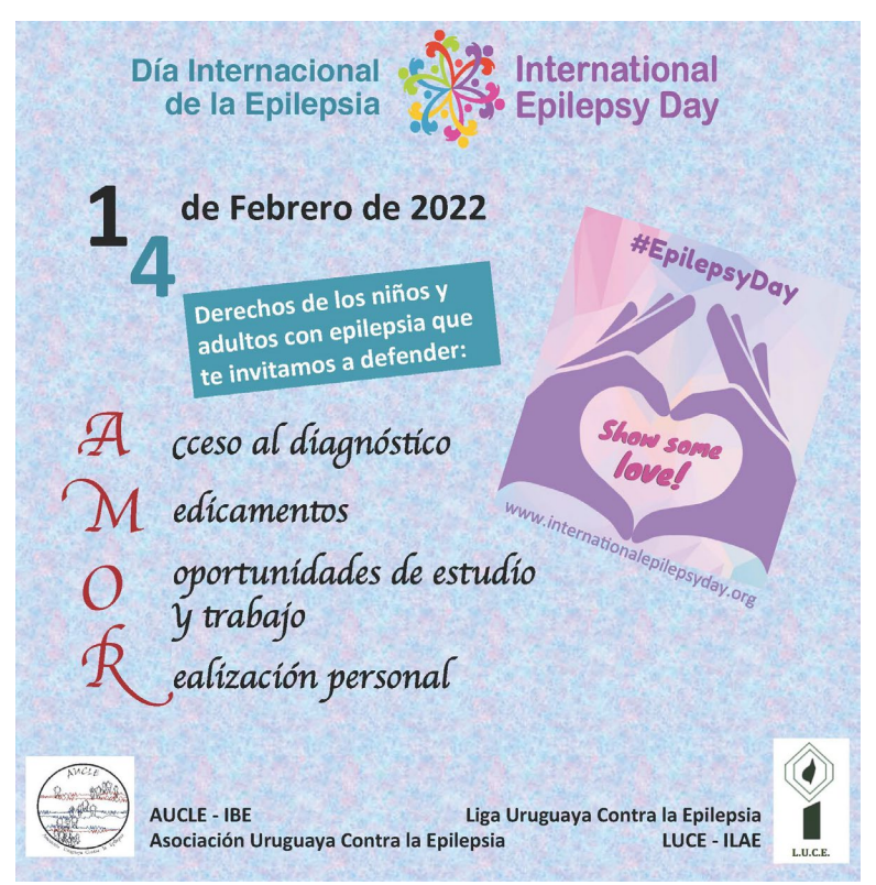
International Epilepsy Day 2022