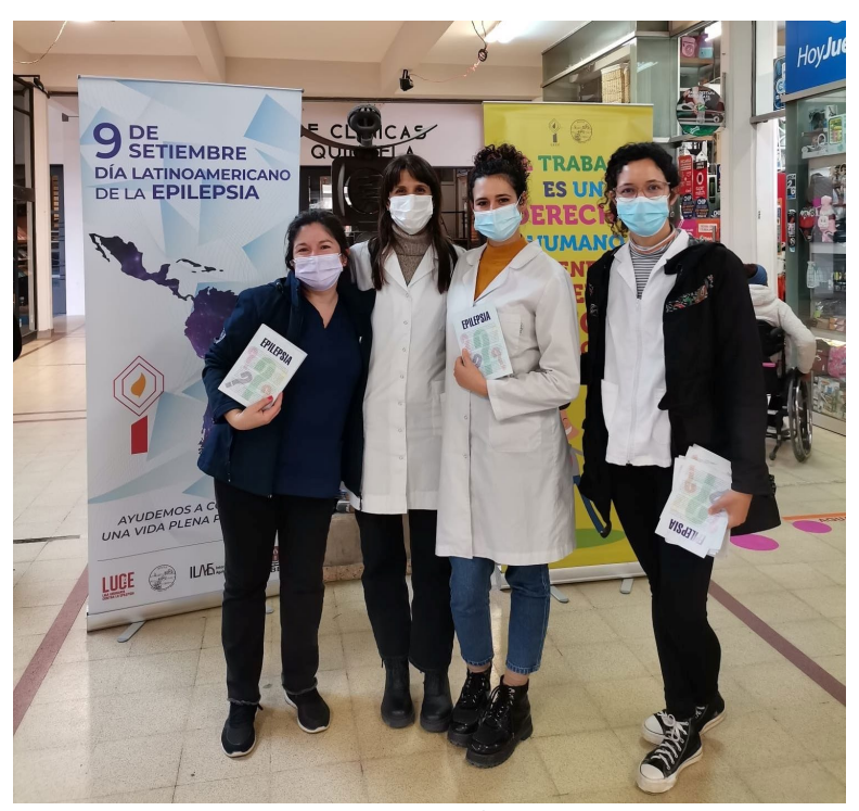
Latin American Epilepsy Day