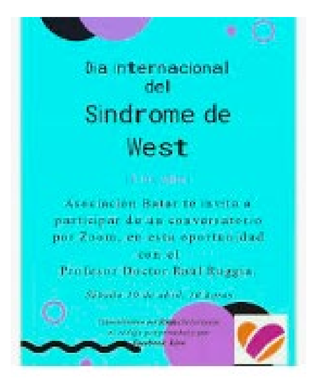
West Syndrome Day 2021