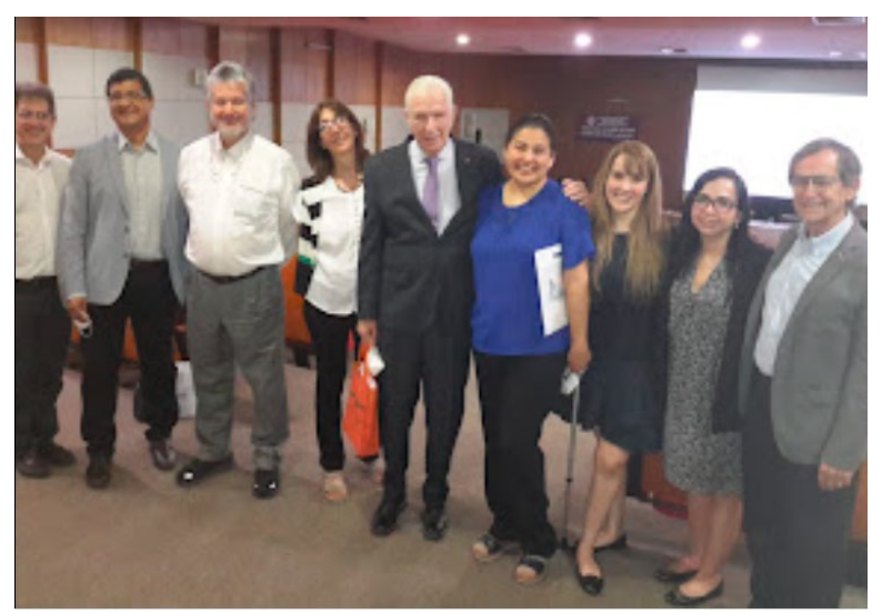
Epilepsy Week in Asuncion