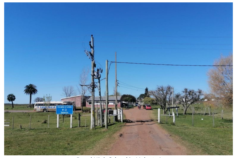
Rural High School in Valente1