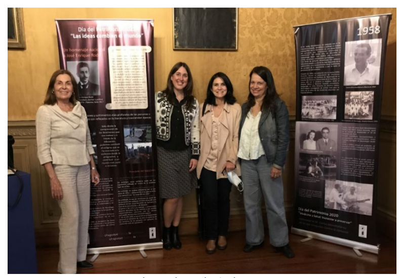
At the Anthropological Museum