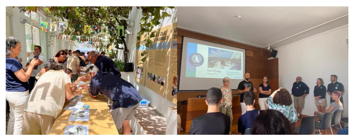
Sail for Epilepsy in Almada