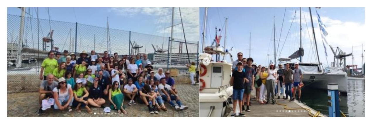
Sail for Epilepsy in Lisbon