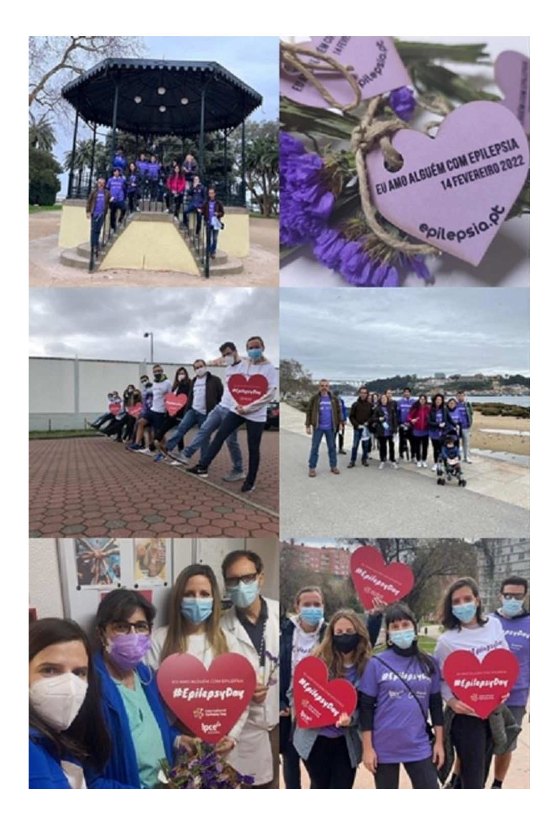
2022 International Epilepsy Day in Portugal