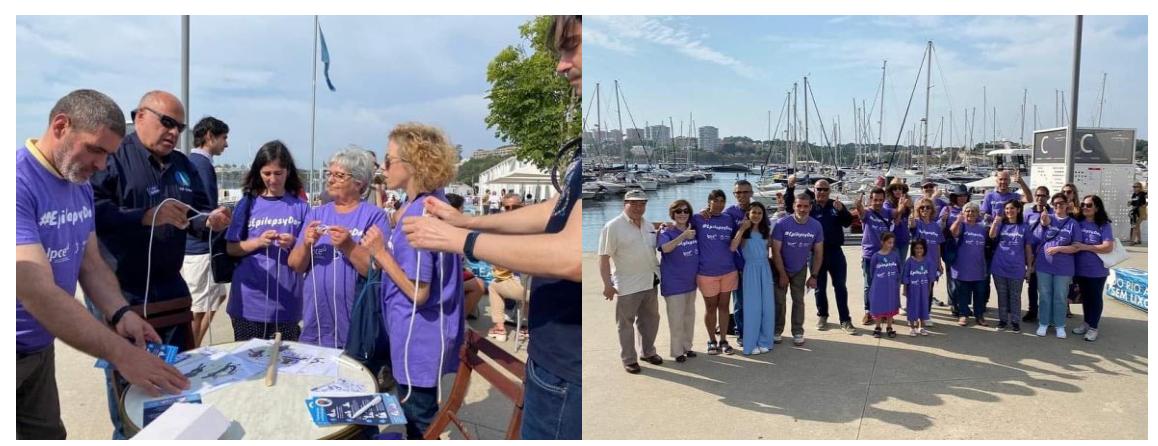
Sail for Epilepsy in Oporto