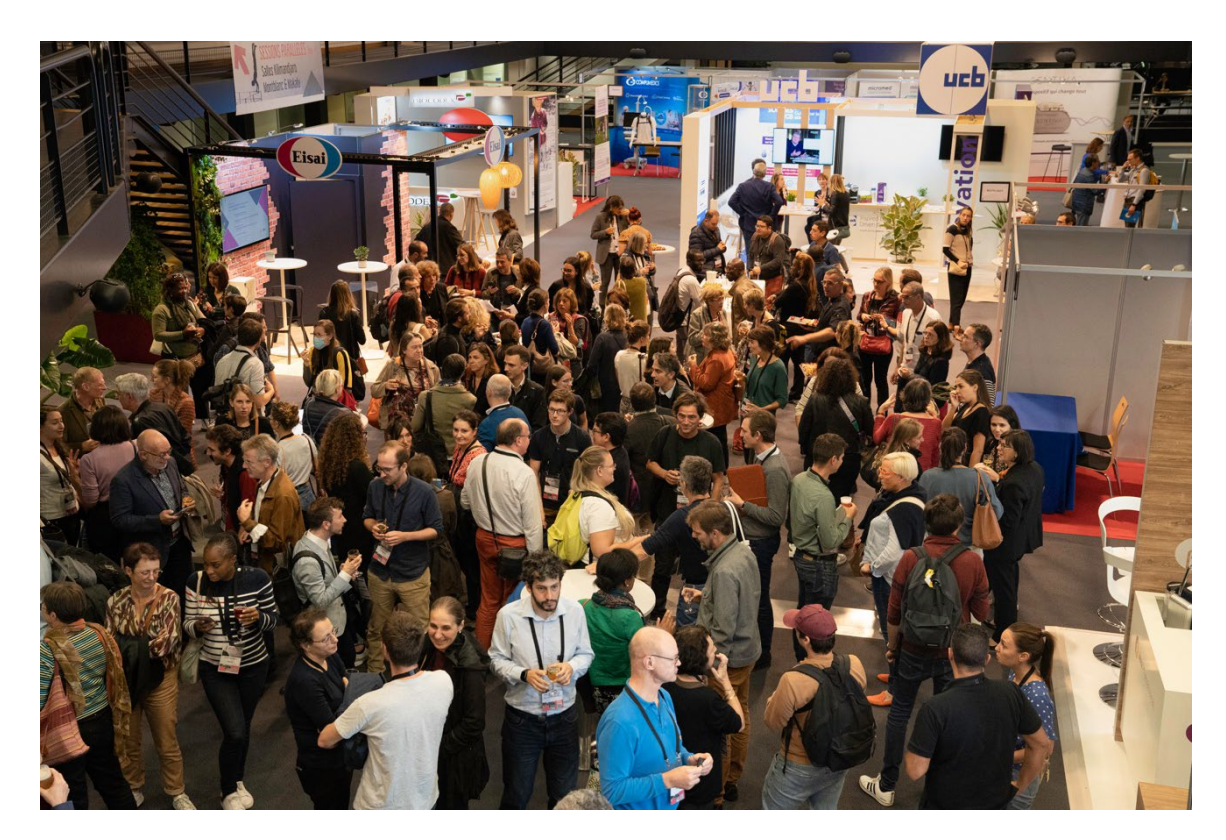
JFE 2022 Congress