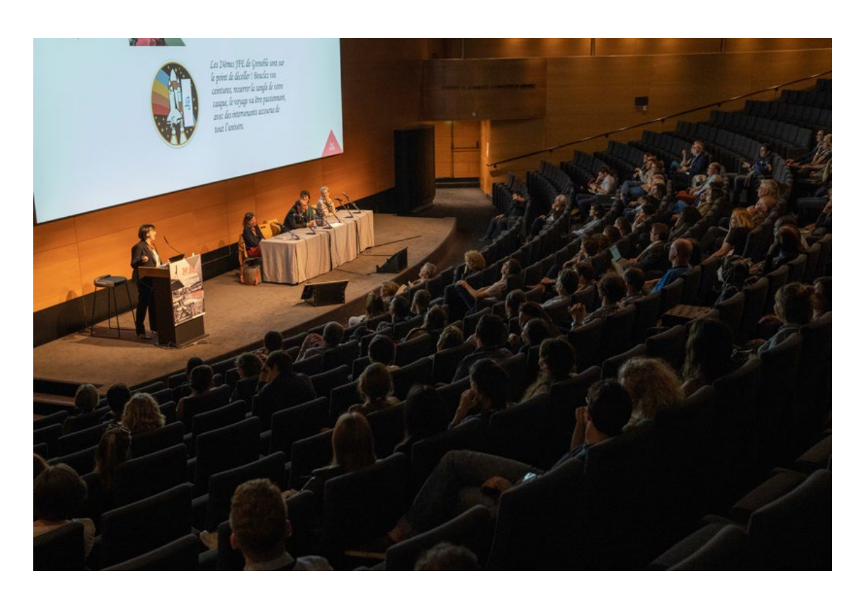
JFE 2022 Congress Plenary Session