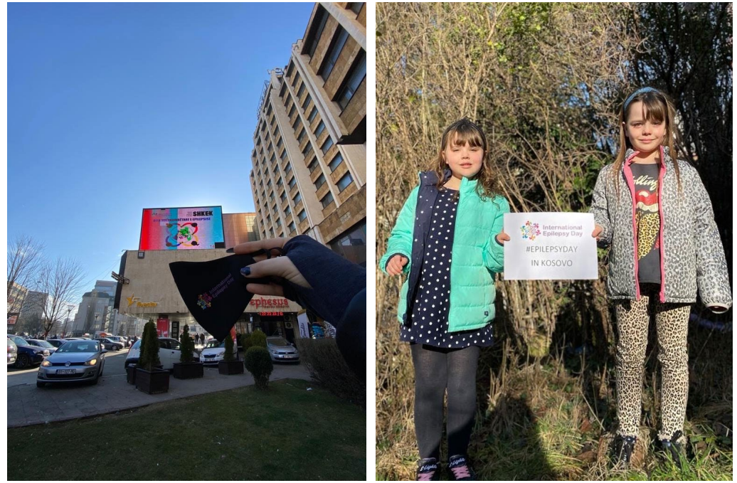
International Epilepsy Day Informative Campaign, 2021, in Prishtina, Kosovo