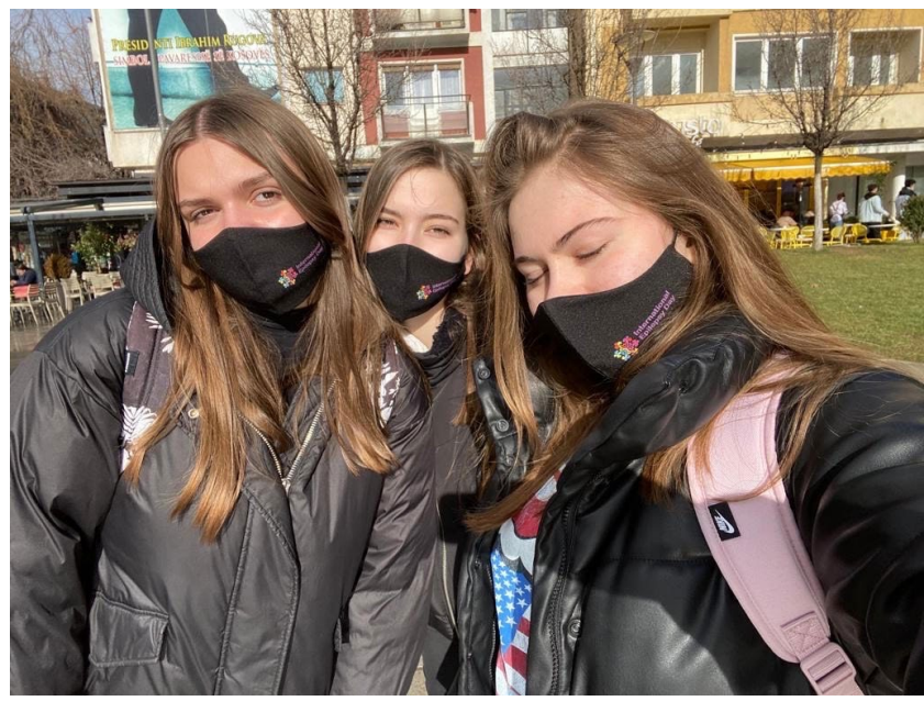
Students from working group for the International Epilepsy Day Informative Campaign, 2021, in Prishtina, Kosovo