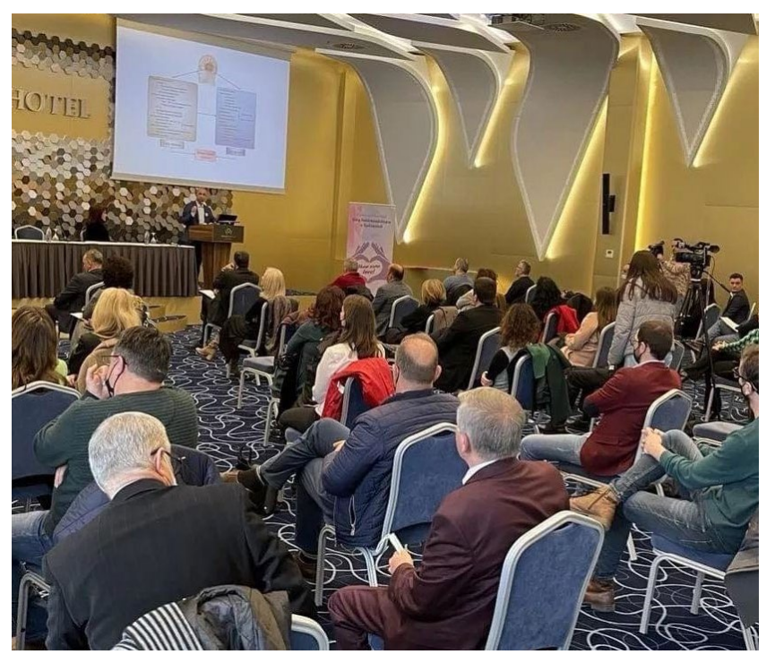
Participants in the Epilepsy and COVID-19 Symposium, 2022, in Prishtina, Kosovo