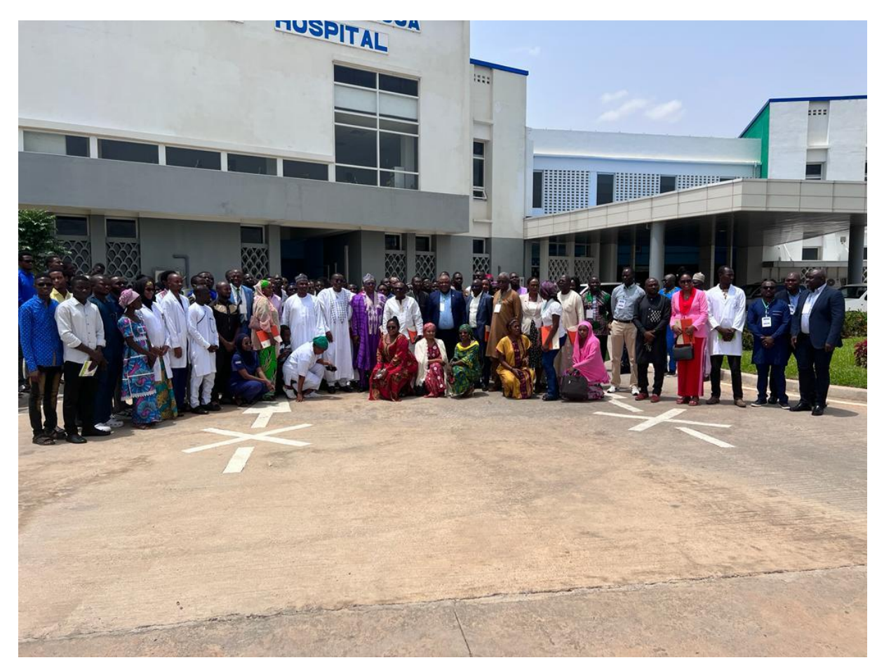
Figure 3: Group photo of the event with the Secretary General of the Ministry of Public Health