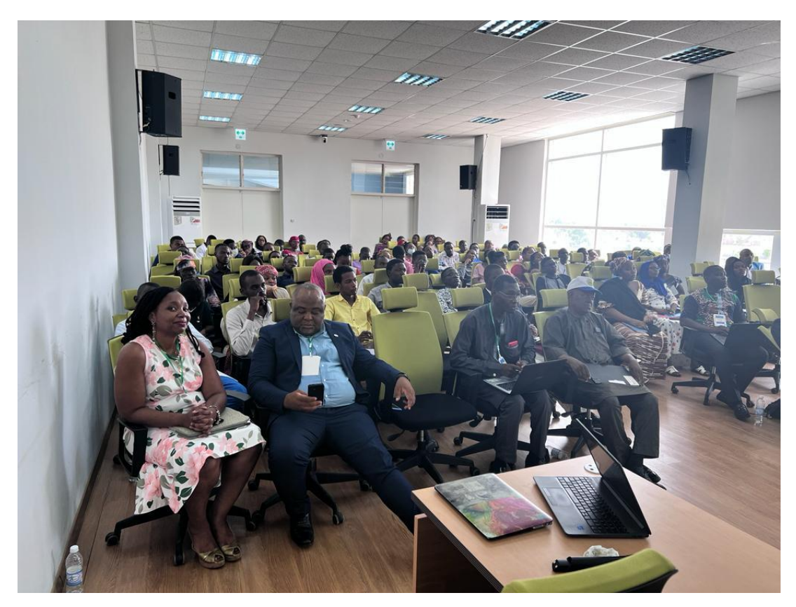
Fig 2: Conference Hall of the Garoua General Hospital with attendees and faculties during the CAN/CLAE training course