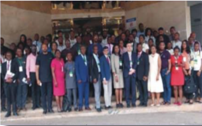
Attendees at the 2nd Annual Enugu Nigeria International Collaborative Course on Epilepsy and EEG in Clinical Practice.