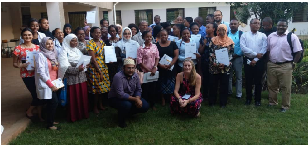
Delegates and faculty for the Moshi, Tanzania PET course.