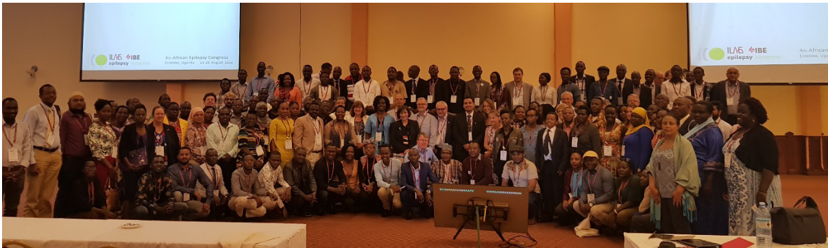
Conference participants of the 4th AEC

In February, the Ivorian Association Against Epilepsy also held a meeting with the theme of “Epilepsy of the Child: Diagnostic difficulties and care,” attended by 77 clinicians. In March, the Malian League Against Epilepsy in collaboration with the Societies of Neurology, Obstetrics and