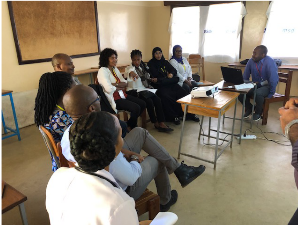
Small group tutorial teaching for the Moshi, Tanzanian PET course.