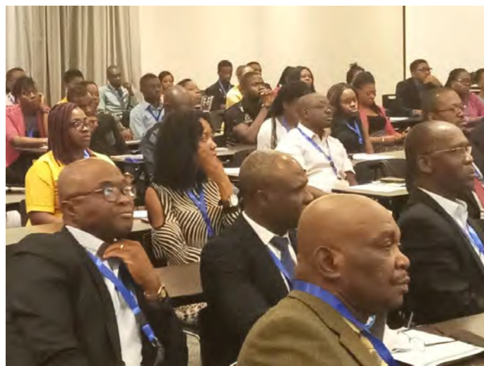
Lecture during the workshop and training on epilepsy for neurologist, residents, psychiatrists, and neurosurgeons in Nigeria,