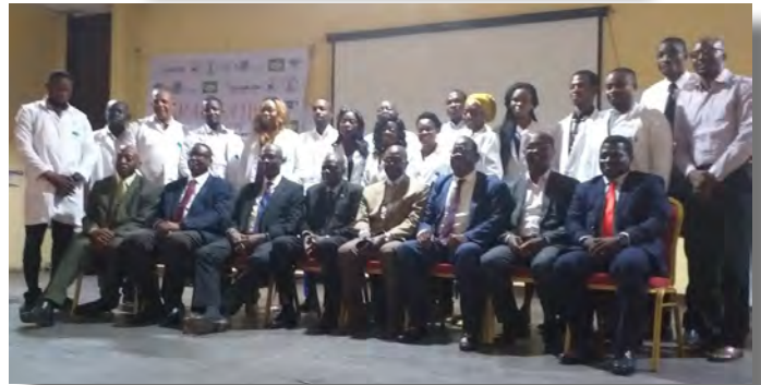
Graduates of the basic EEG course and some members of faculty.