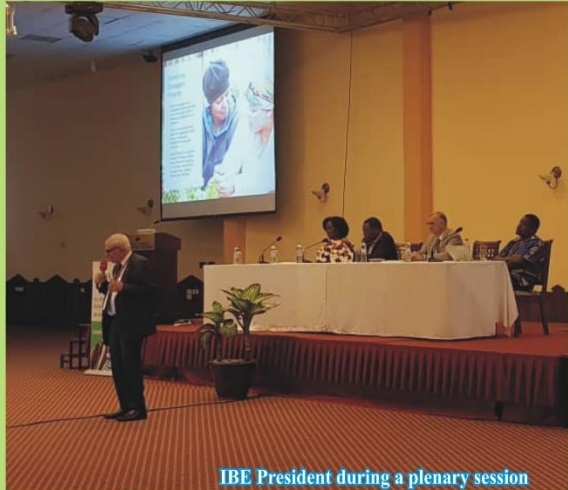
IBE President during a plenary session