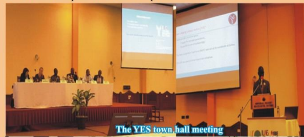
The YES town hall meeting