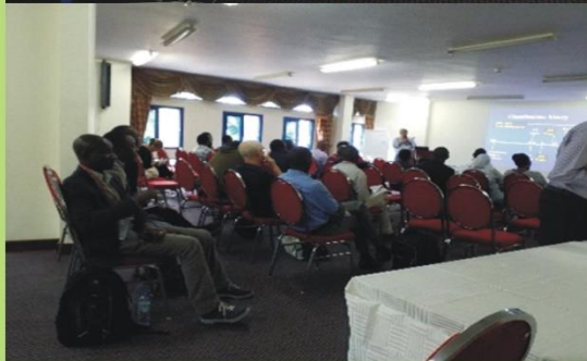
ILAE-IBRO Epilepsy school