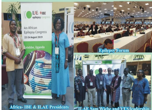
Africa- IBE & ILAE Presidents