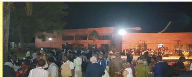
Social interactions by the pool