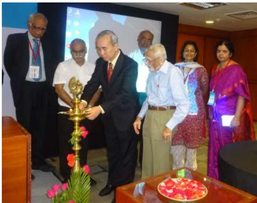
Inauguration of the 9th IES EEG workshop at Hyderabad