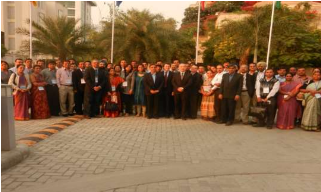
Figure 1. Group Photograph of Participants of Epilepsy School

Epilepsy Video Presentation Quiz by faculty, Benign epilepsy syndromes, Treatment decisions, When to stop AEDs? Non-epileptic paroxysmal, Morbidity & mortality in epilepsy, Epilepsy surgery, Video and case presentations by the faculty and delegates.