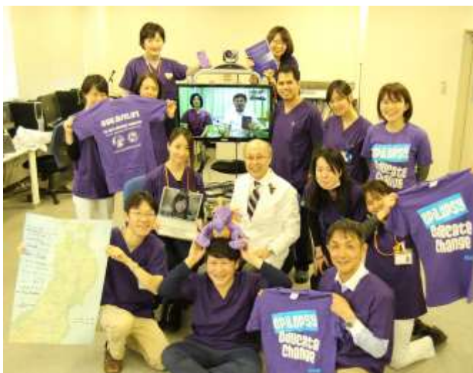
2014 Purple day at Tohoku University

In Tokyo meeting, specialists with epilepsy will present educational program and Japanese people with epilepsy will advocate their opinion with some special musical events.