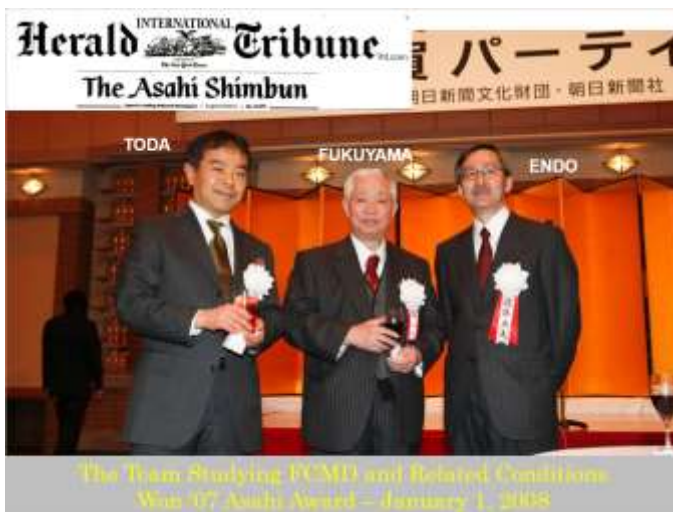
The Team Studying FCMD and Related Conditions Won '07 Asahi Award – January 1, 2008

8èmes Journées Françaises de l'Epilepsie, Toulouse, 2004