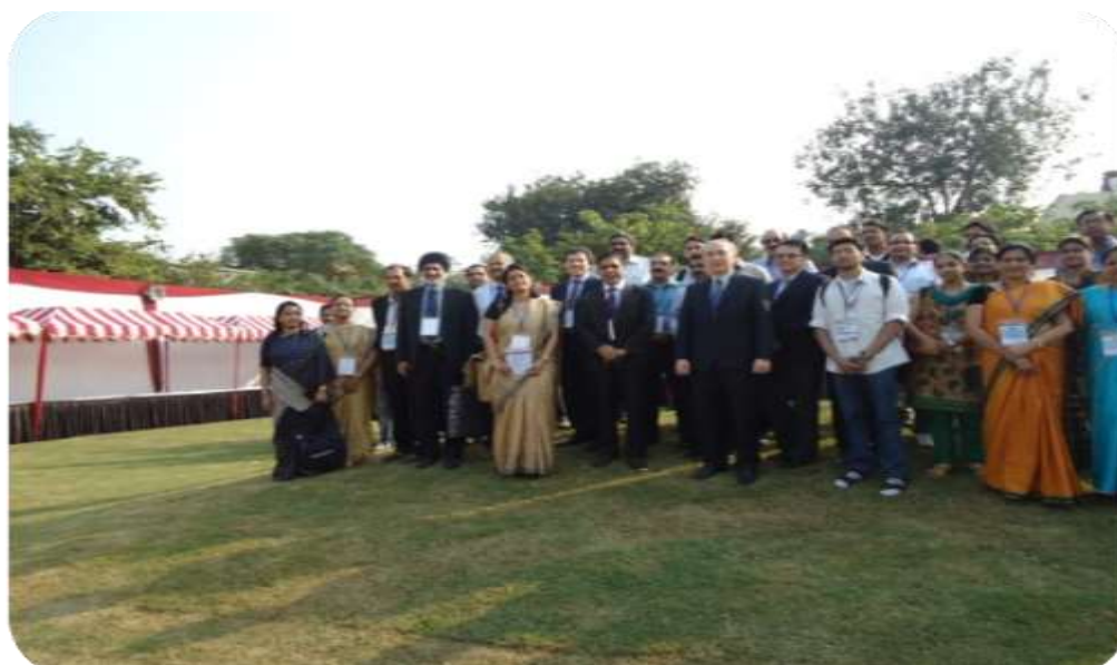
Figure 2. Group photograph of EEG workshop participants