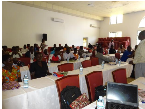
Symposium attendees DAY 2