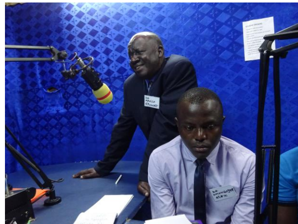
The Radio Talk Show facilitators on the topics related to Epilepsy