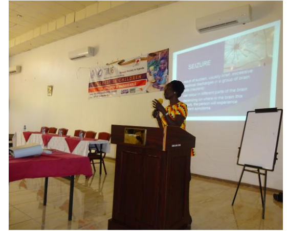
Some of the Symposia speakers giving their talks