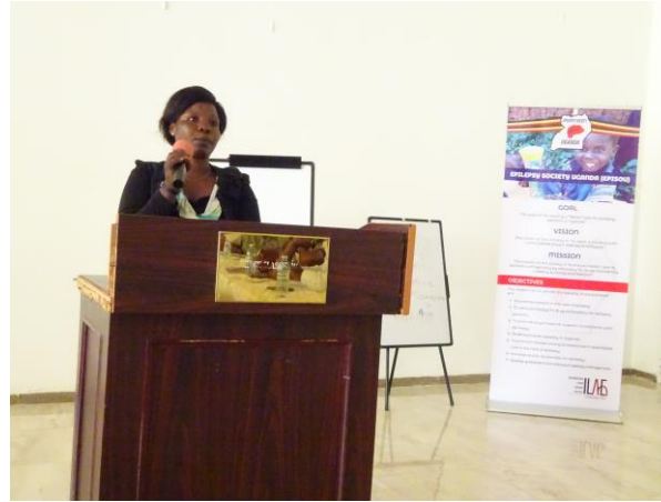
Some of the caregivers with children having epilepsy sharing their story