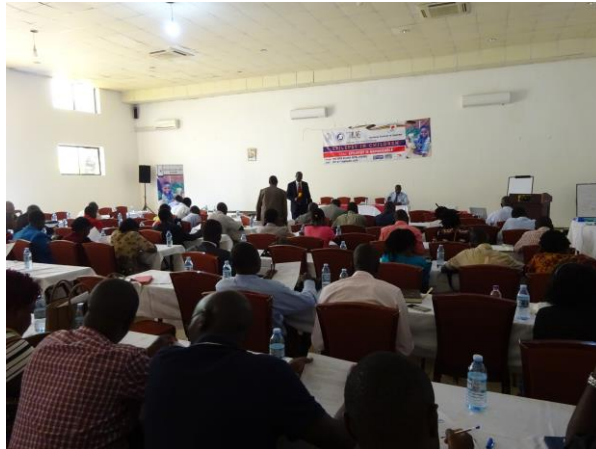
Symposium attendees DAY 1