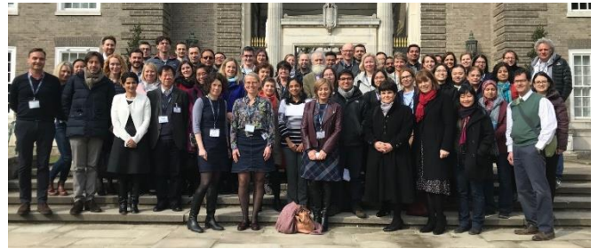
Class in 2018, Cambridge UK