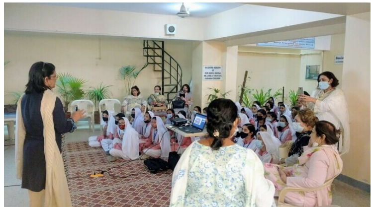
Inner Wheel School Workshop