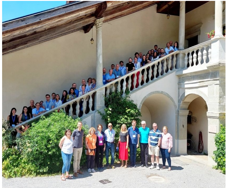
Photo: Commemorative photo of the participants of WONOEP 2022 at the entrance of the Tufts center in July at Talloires, France.

The XVI Workshop on Neurobiology of Epilepsy was organized and occurred between 2022 July 4-8, at Talloires, France, on the topic of “Early onset epilepsies: neurobiology and novel therapeutic strategies”. This was made possible with the generous support of the ILAE and other donations. Twelve “Raman Sankar bursaries for young investigators” were awarded. The proceedings are currently under preparation and will be published as critical reviews. The committee for the next WONOEP (XVII) was formed and the topic agreed.