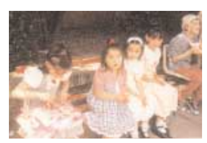
Children with epilepsy at the Hospital Calvo Mackenna

The international political gap refers to differences in planning and assignment of funds at the national level. In Chile there is no such planning for epilepsy, again contrasting with developed countries, where epilepsy health programmes have existed for several decades.