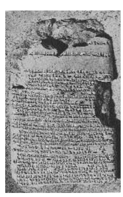
Epilepsy Tablet in the British Museum

The rapid development of structural and functional imaging techniques in the last thirty years, including CT, MRI, SPECT and PET, has had a major impact on the investigation and understanding of