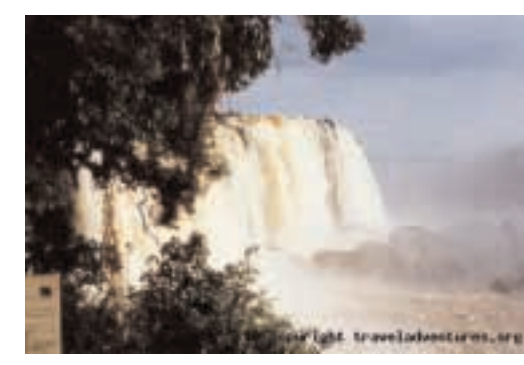
The impressive waterfalls at Iguazu - the location of the Latin American regional meeting held earlier this year.

ILAE EC in order to meet their own specific needs. One particular situation is that of the Commission for North American Affairs, which covers a very large and active epileptological community divided into only three Chapters (Canada, Mexico and the USA); furthermore, the American Epilepsy Society (the USA Chapter) has many members from Canada and Mexico and is currently carrying on many activities that could be attributed to a Regional Commission. For this reason, we are evaluating a special regulation for North America that could