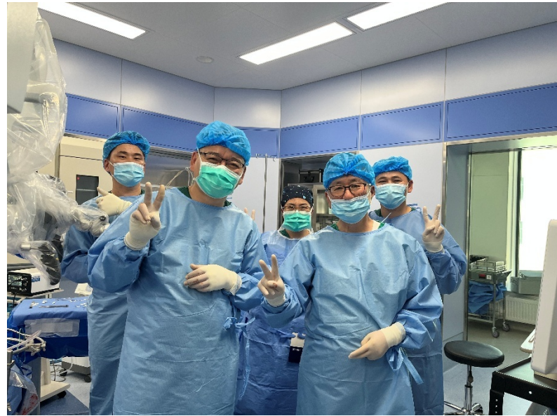
Figure 9. Prof. Kensuke Kawai mentoring the surgical team during the epilepsy surgery