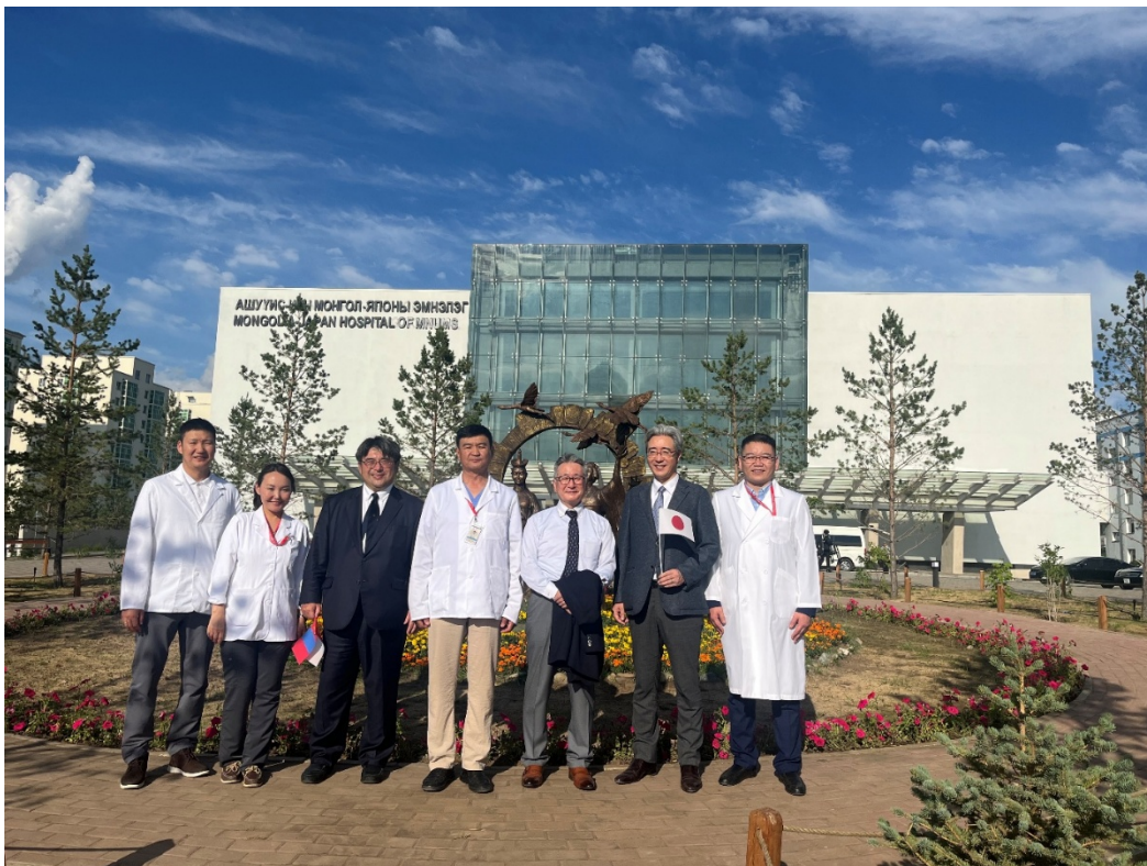
Figure 15. Team photo in front of the Mongolia-Japan Hospital, Ulaanbaatar.