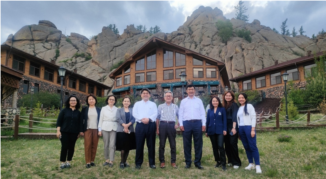
Figure 14. Dinner with team in Terej National Park

We would like to express our sincere gratitude to the Japanese professors for visiting our center. After three days of intensive clinical collaboration, the team shared a moment of relaxation with a group dinner and a visit to Terej National Park—strengthening professional ties and celebrating international cooperation.