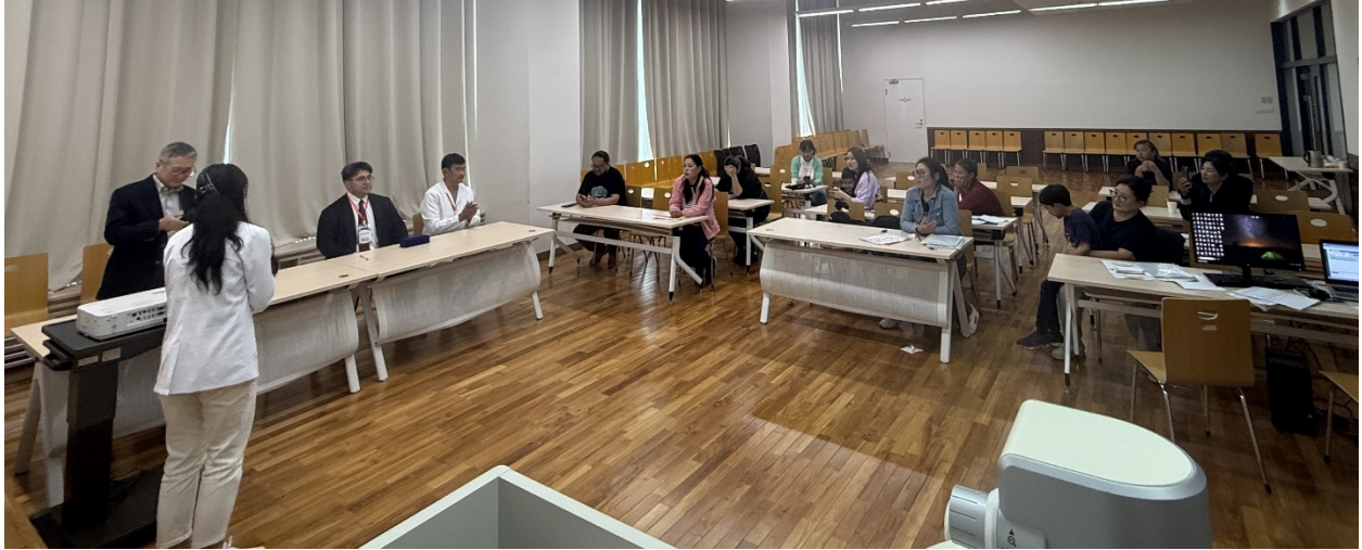
Figure 7. Day 2 – Prof. Kensuke Kawai introducing the concept of epilepsy surgery during a public education session with patients and their families.