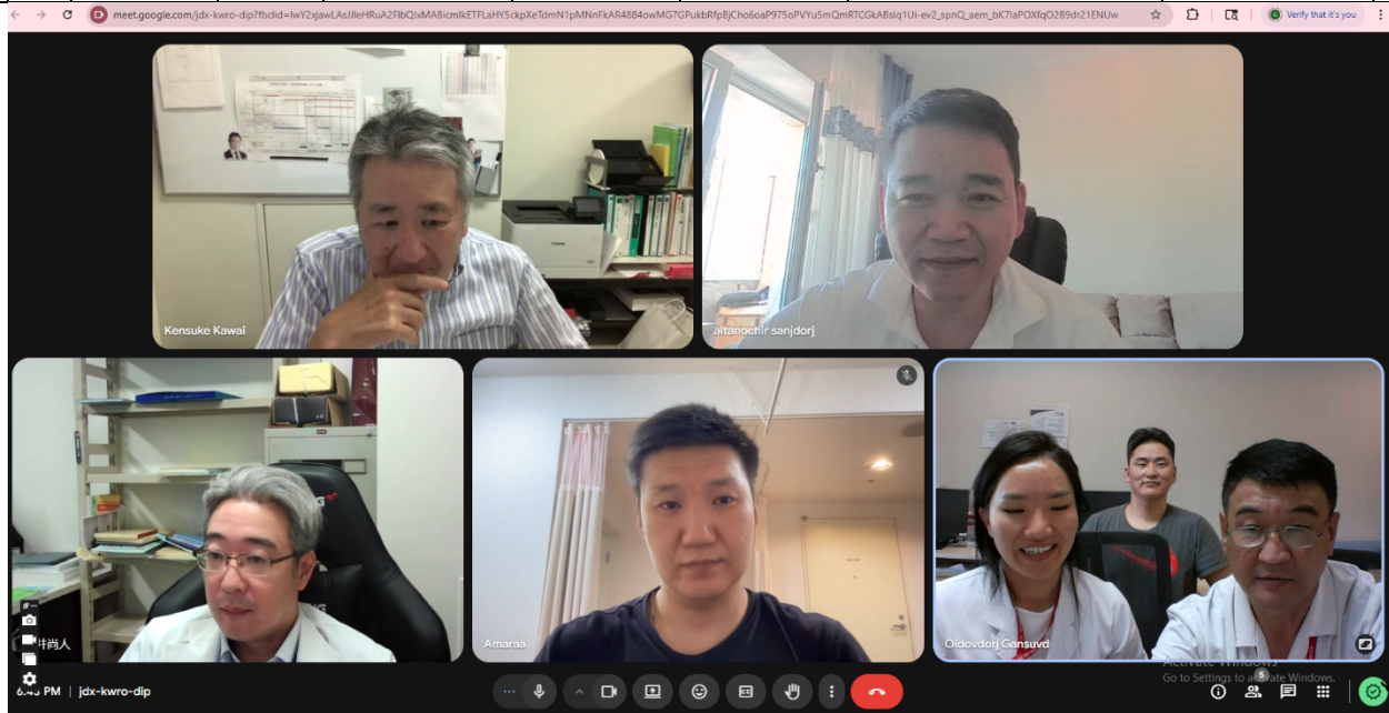
Figure 1. Online case discussion