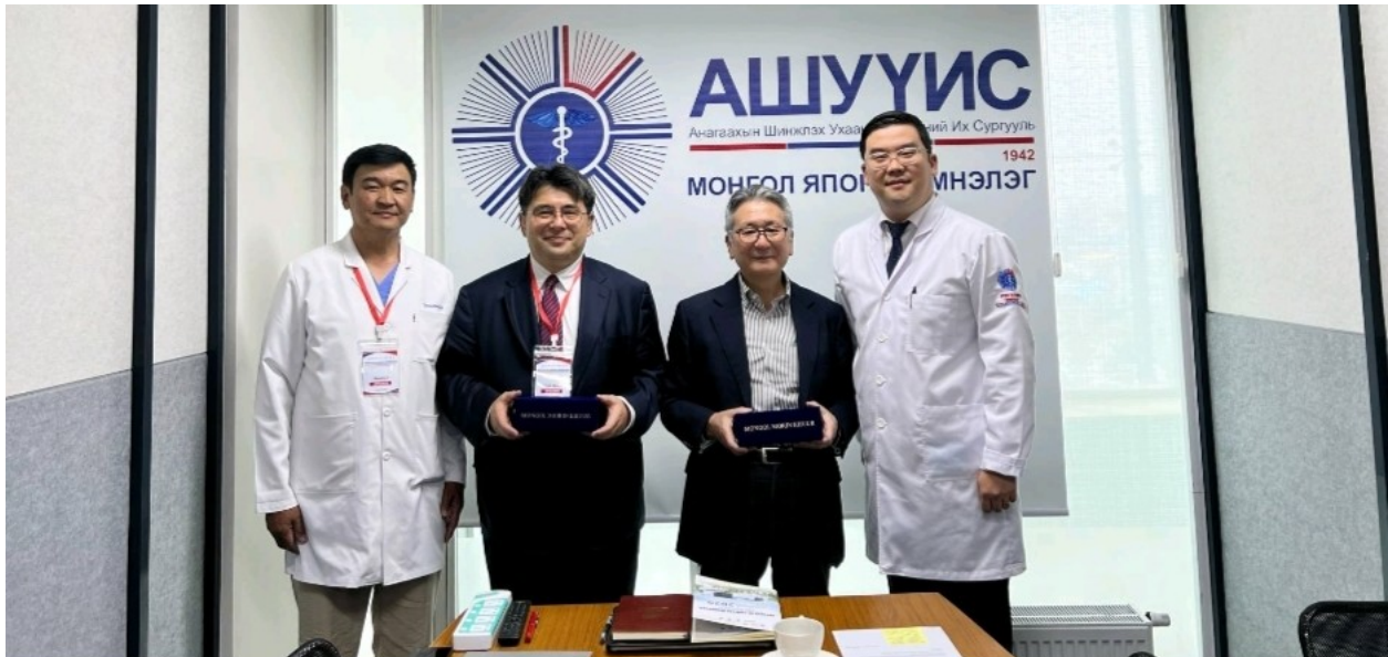
Figure 12. Meeting with Director of Mongolia-Japan hospital

To support the implementation of the program, the mentors held a meeting with the Director of the Mongolia-Japan Hospital. The Director expressed full support for the initiative and emphasized the hospital administration's willingness to assist in securing essential equipment and human resources. Future collaboration with the Departments of Neurology and Neurosurgery was also discussed, with a focus on the sustainable development of epilepsy surgery services.