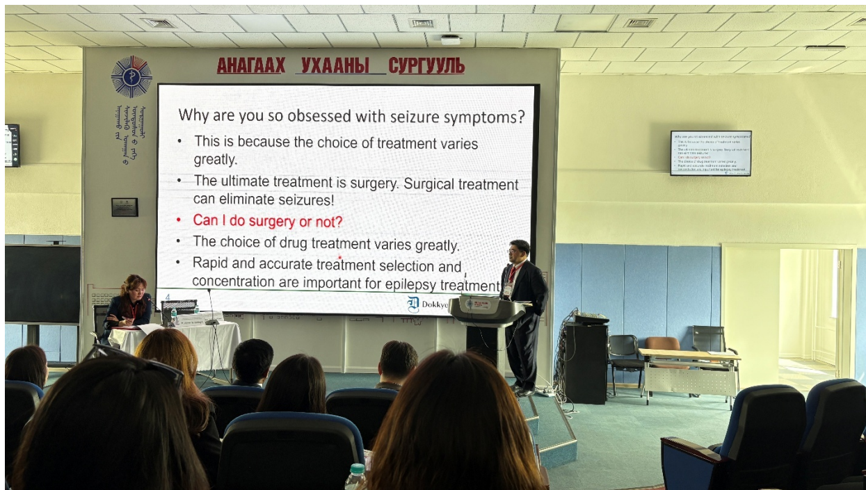
Figure 5. Prof. Hideaki Shiraishi presenting during the symposium