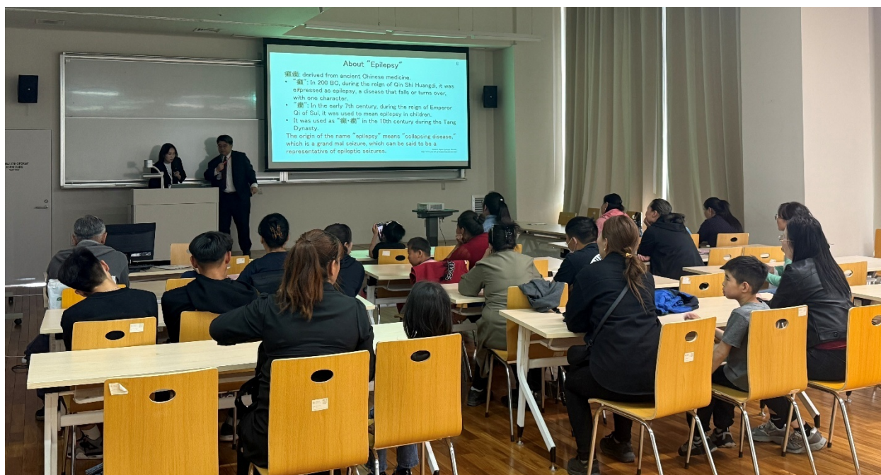
Figure 6. Day-2 Prof. Hideaki Shiraishi presenting during the public education sessions for patients and their families