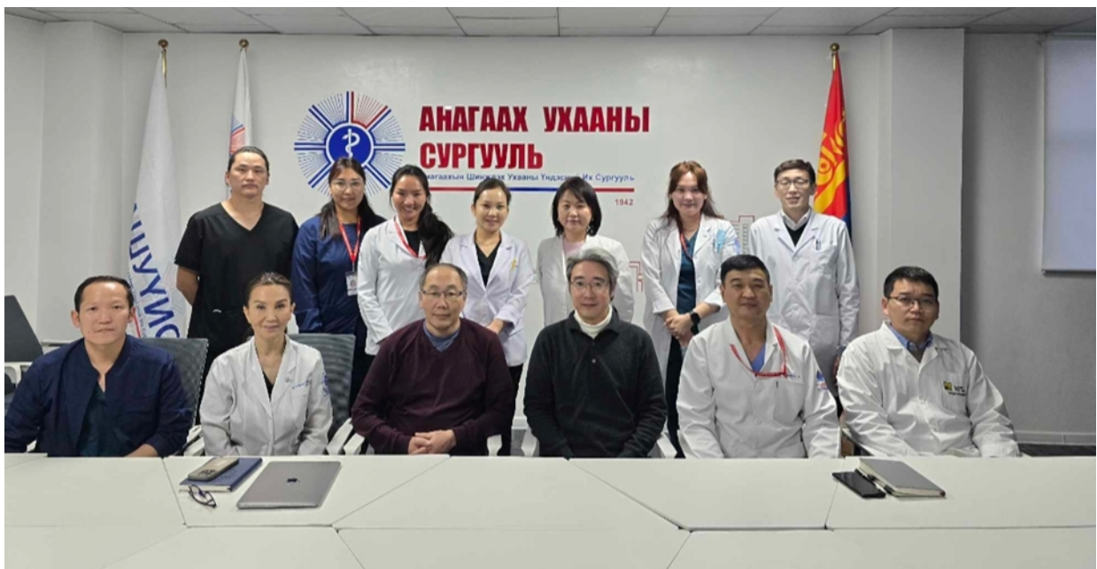
Figure 13 Meeting with Department of Neurology and Neurosurgery, School of Medicine, Mongolian National University of Medical Sciences