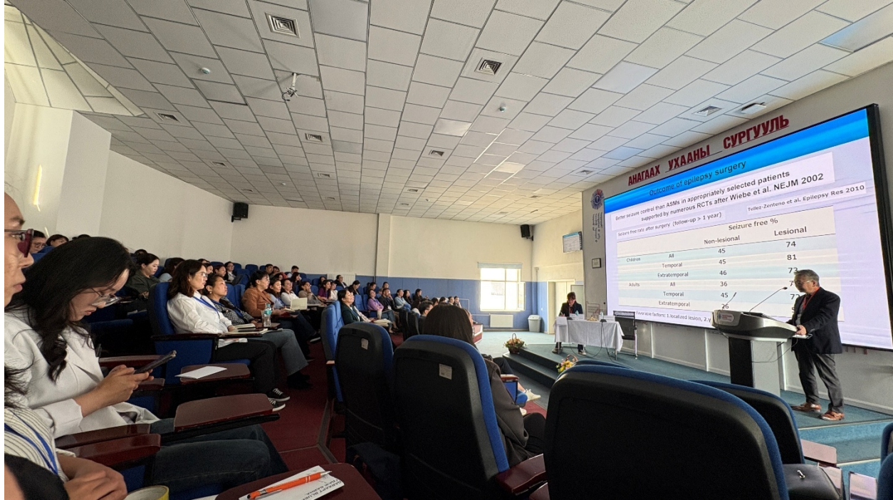
Figure 4. Prof. Kensuke Kawai presenting during the symposium