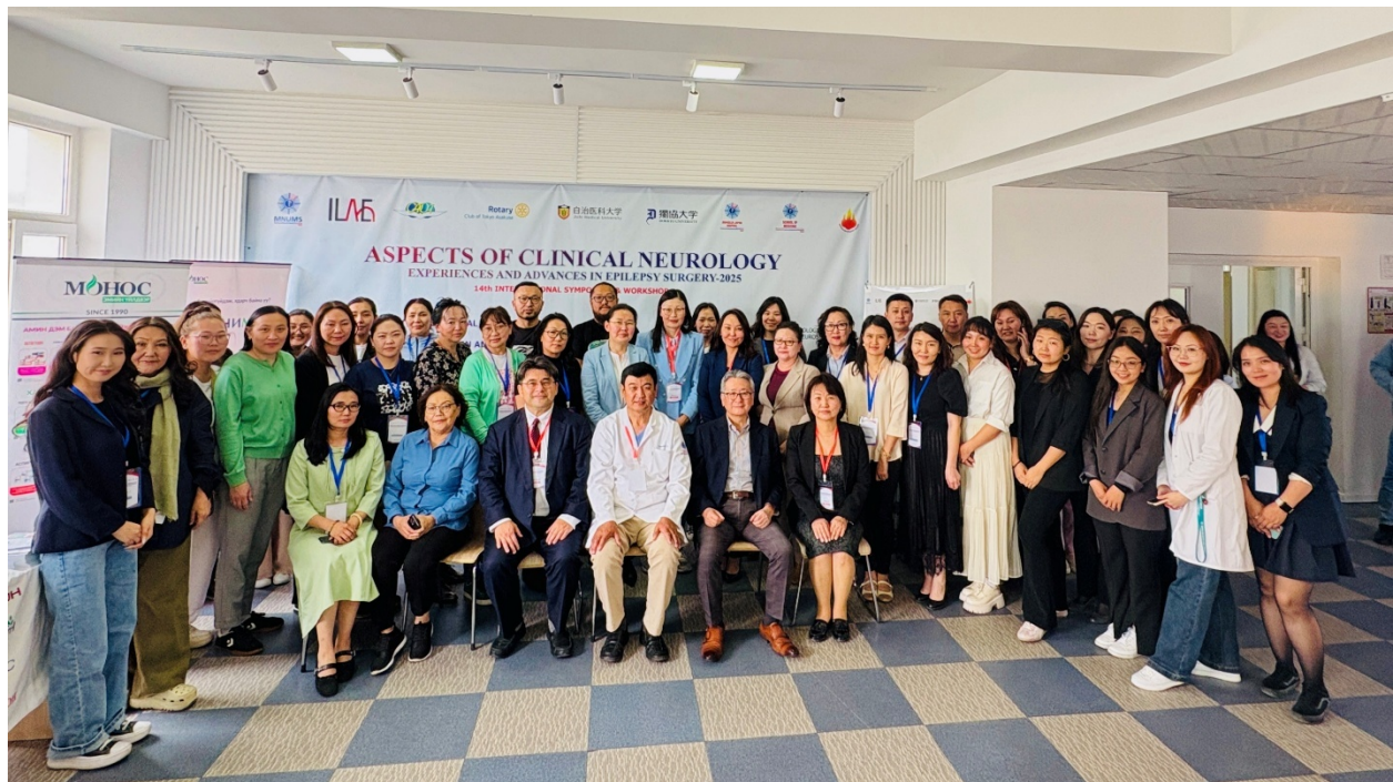
Figure 2. “Experiences and advances in epilepsy surgery” workshop/symposium

This integrated approach—combining surgery, professional education, and direct patient care marked a significant step toward establishing a sustainable and advanced epilepsy surgery program at the Mongolia-Japan Hospital.