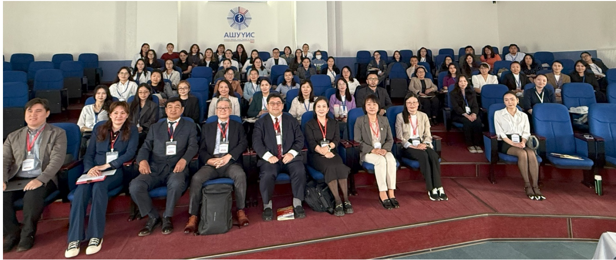
Figure 3. “Experiences and advances in epilepsy surgery” workshop/symposium