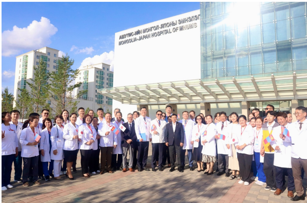
Figure 16. Group photo at the hospital following the meeting with Their Majesties

During our program, we had the honorable opportunity to welcome Their Majesties Emperor Naruhito and Empress Masako of Japan to the Mongolia-Japan Hospital. Their Majesties personally met with our team and were introduced to our ongoing activities—a truly memorable and significant moment for all involved.