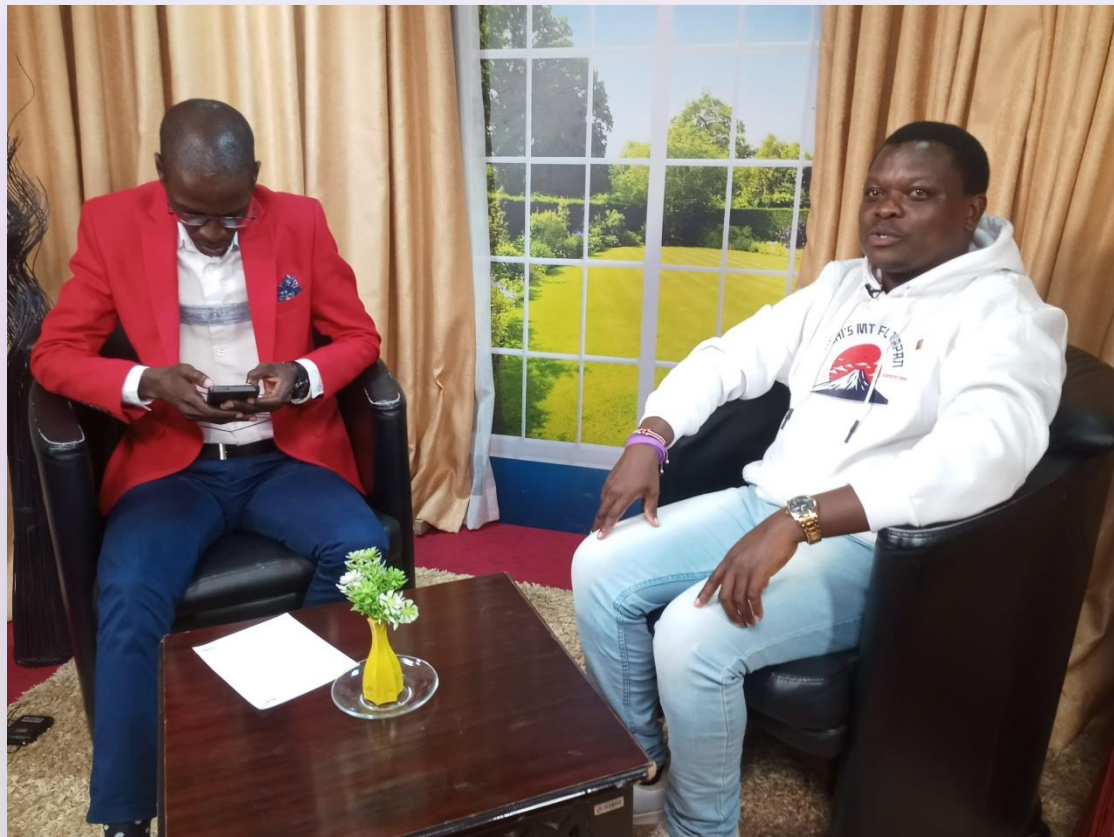
On set for a Tv interview Hope Africa Television talking about the Epilepsy Awareness Expedition.