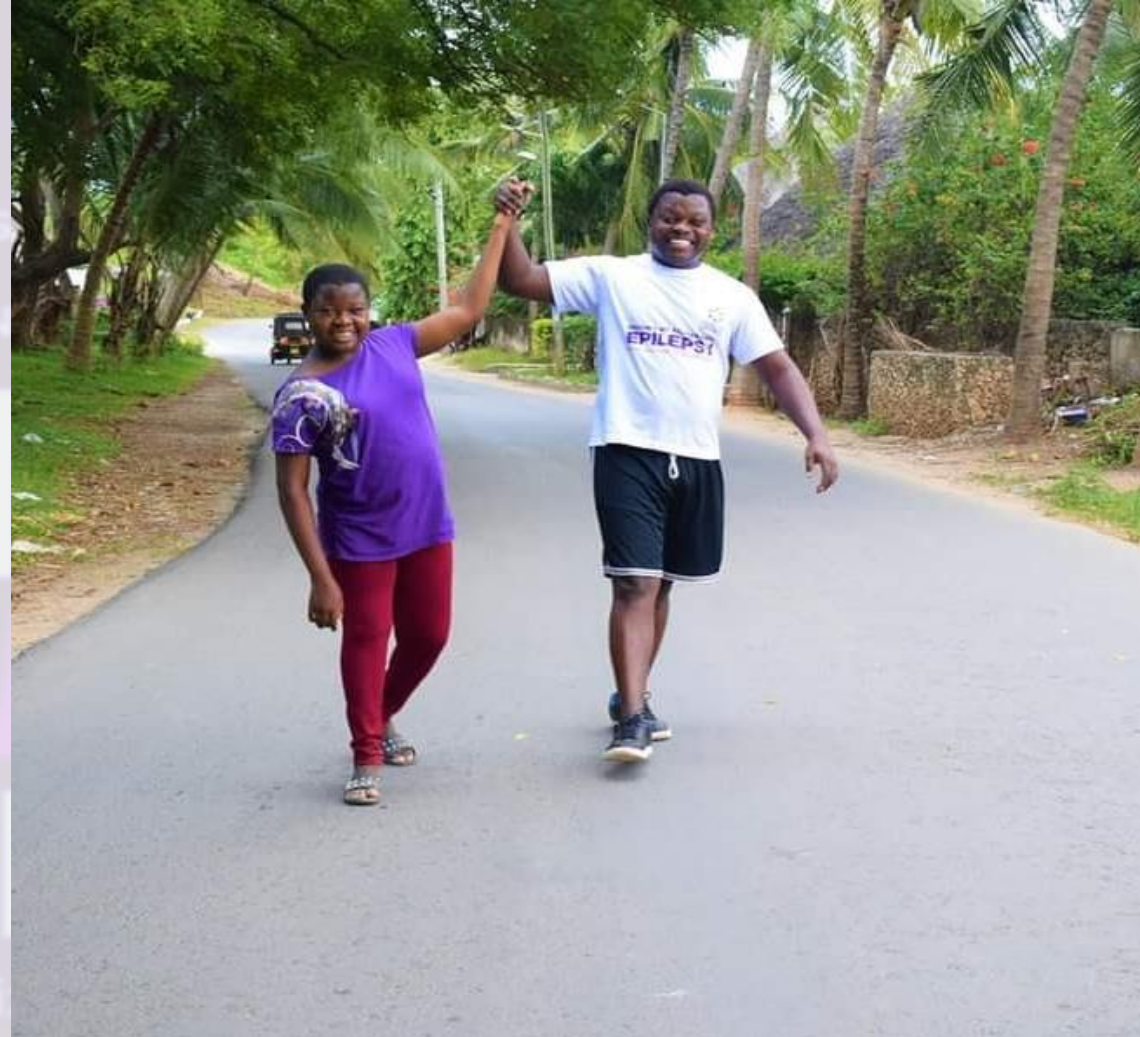
With my sister who is an Epilepsy warrior during Pre-expedition trials.