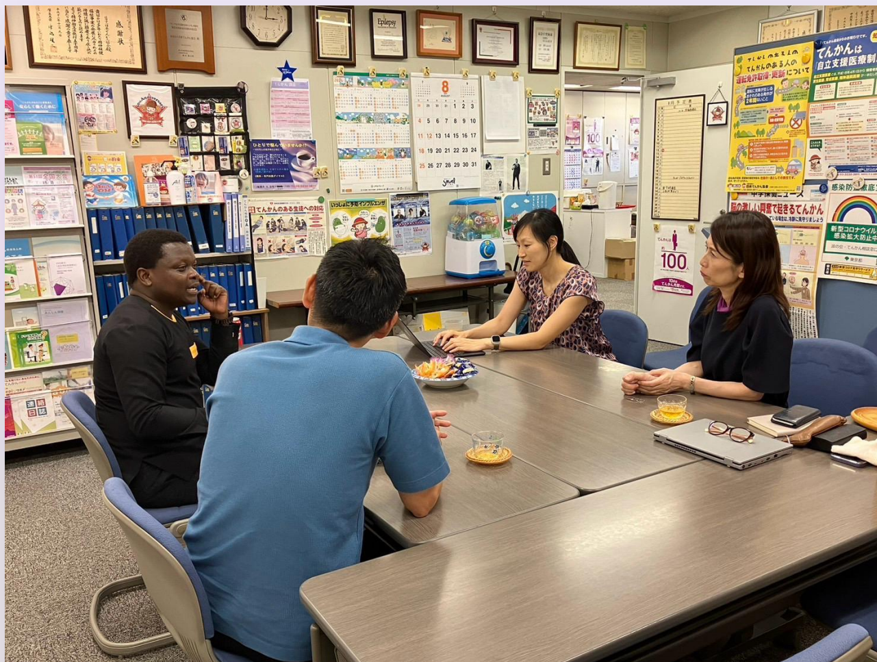
An engagement meeting with Japan Epilepsy Association members.