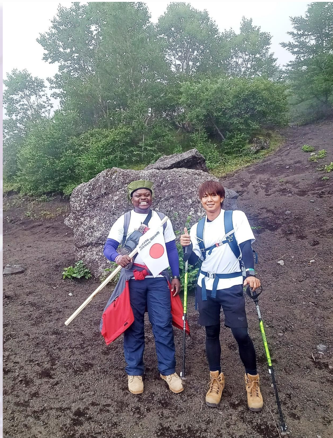
On trek Mt. Fuji with a friend Mountain climber from Japan