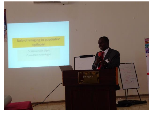
Some of the Symposia speakers giving their talks