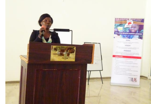
Some of the caregivers with children having epilepsy sharing their story