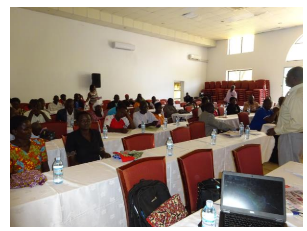
Symposium attendees DAY 2