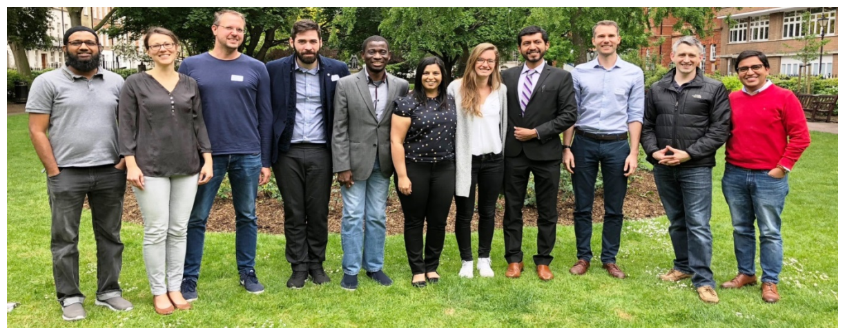
Figure 5: Leadership elected at the kick-off workshop in London

Since the kick-off workshop in London, May 2018 where only one person from sub-Saharan Africa was in attendance, YES-Africa has grown (although much slower than other regions). The AEC provided an opportunity to connect with one another and our membership has more than doubled.