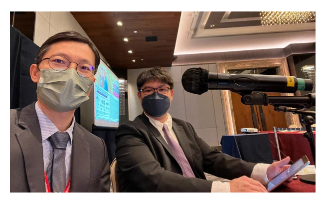
Hong Kong Epilepsy Society and Hong Kong Neurological Society - Joint ASM